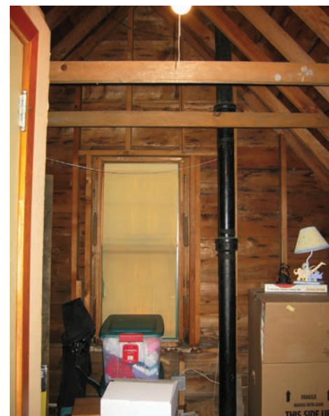
The attic was mostly used for storage before the remodel.

too, with cozy features like built-in bookcases.